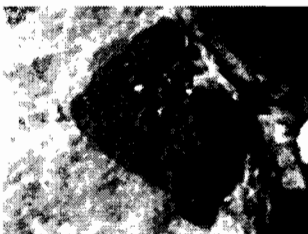
Sulfide against Calcite