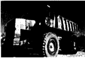
Mine haul trucks