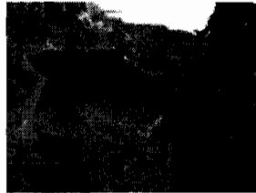
Field black light box