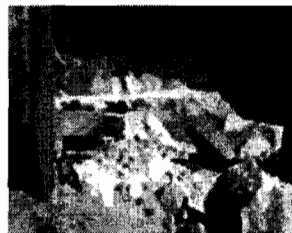
Rock crusher in the White Knob Quarry