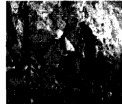
Looking for flourscent materials