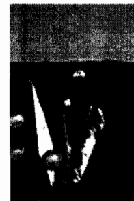
Jim Fosse getting comfy