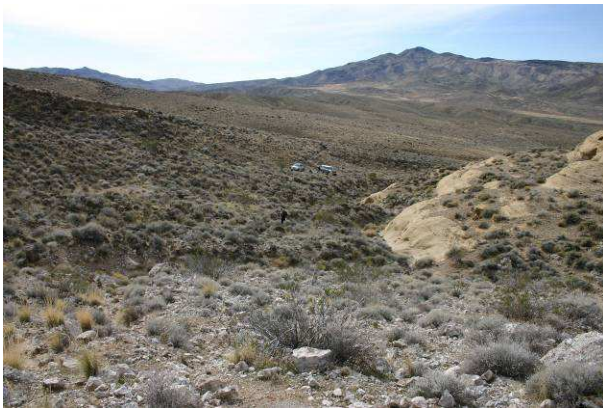
Looking at upper parking lot from the Black/white agate collecting site

Sheep Creek Field Trip continued Pictures Taken from Jim Fosse's Web Page