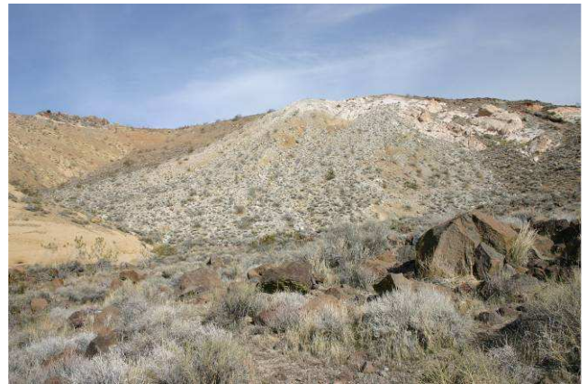
A full view of the collecting hill from the end of the road.