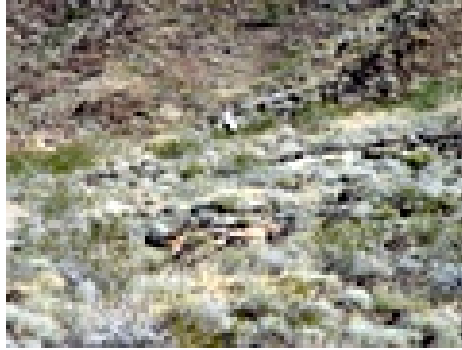
Some of the local terrain.