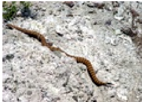
Here's a good shot of the local wild-life.