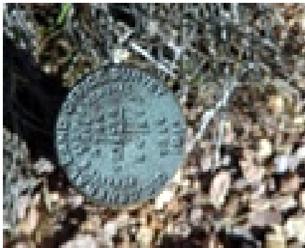
Jim noted that someone came out here with a rod & chain in 1911.