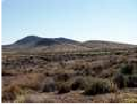
Here is a photo of Opal Mountain taken from a distance.