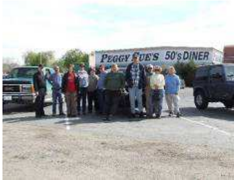
All of us are ready to go outside of Peggy Sue's restaurant.