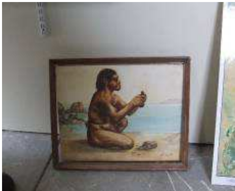
A painting of what "early man" might have looked like.