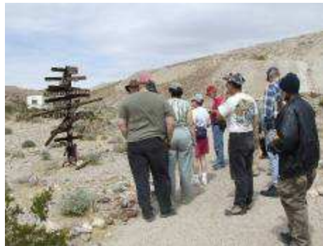
Sign posts to other archaeological digs