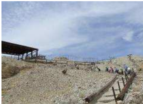
A long climb to the dig site.