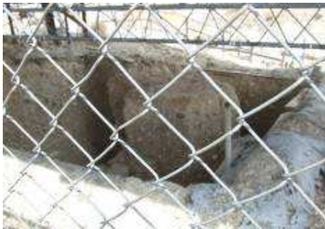
Pit #1 founded by L.Leahey.