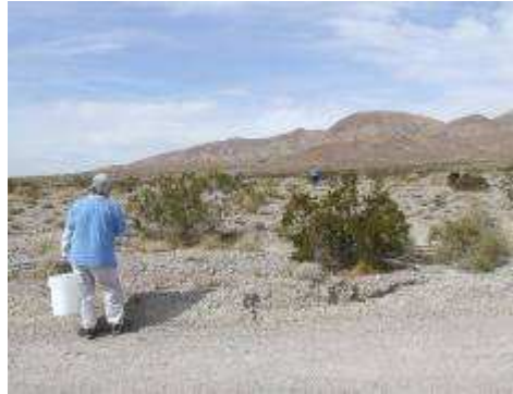
Collecting Palm Root and other goodies on the road to Early Man site.