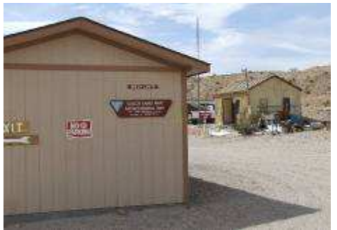
Outside the offices of the Early Man Site.