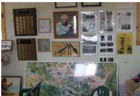
A wall of memories, achievements and personalities inside the lecture hall.