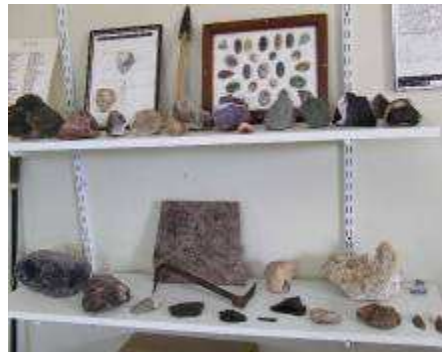
Artifacts and geologic samples from the area.