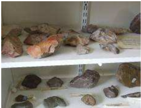
Inside the museum and lecture hall.