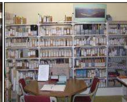
I'm shown upcoming club events. The club library was impressive!