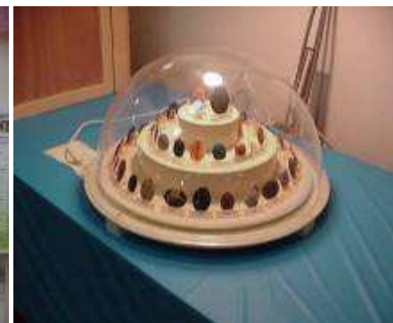
We had some beautiful displays