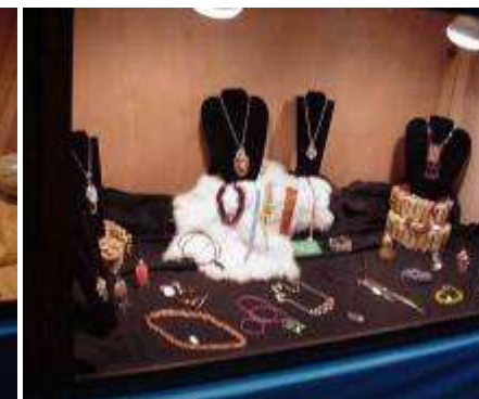
This display shows many of the pieces our members make.