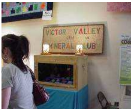
The public saw some minerals glow in the dark.