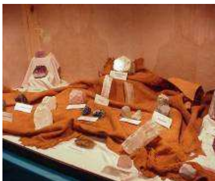
Well displayed minerals.