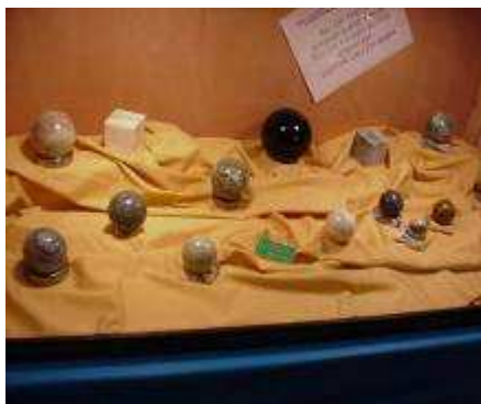
The public got to see a display of the cubes and spheres from local stone.