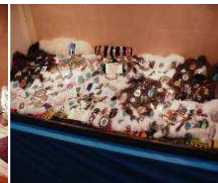
A lot of work went into this display.