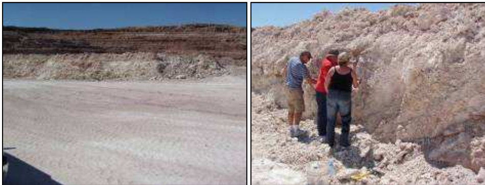
The mine was quite a big operation and members collected specimens.