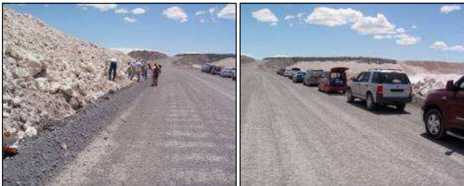
The mine had a well graded but steep road. Members caravanned their way up to the top.