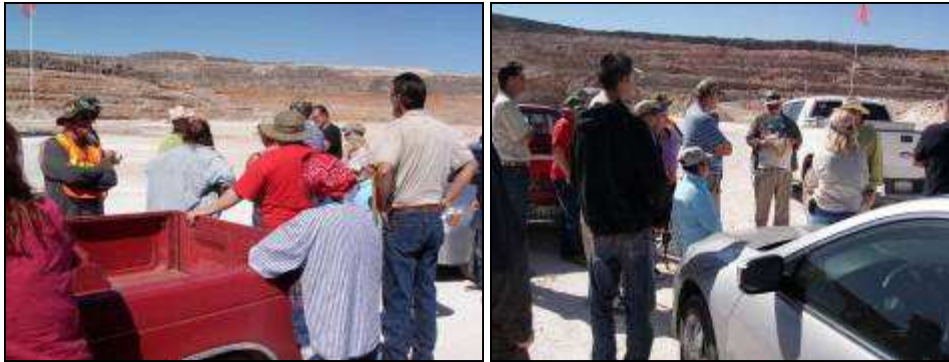
Members are listening to their guide on what to see, expect and what to find.