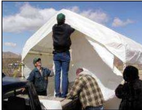
It really tok on the appearance of a little village. The men are putting up the food tent.