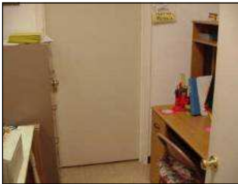
The office in the club is really small! You can't see the club computer or printer—they are behind the door. Nevertheless, board members and instructors use this space to work in (when necessary) and pick up their mail.