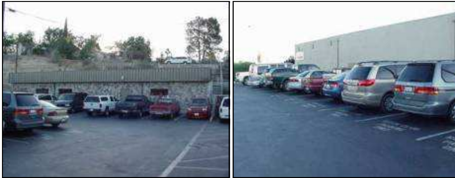
This is the club, the night of the monthly meeting. The parking lot is always full.