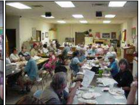
The club is full on general meeting nights. We love to eat!