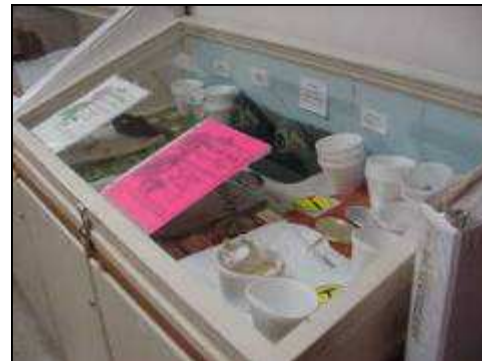
Our club always has a raffle.