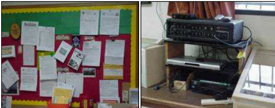
The Bulletin board has important information. This A/V equipment is used a lot on educational nights!