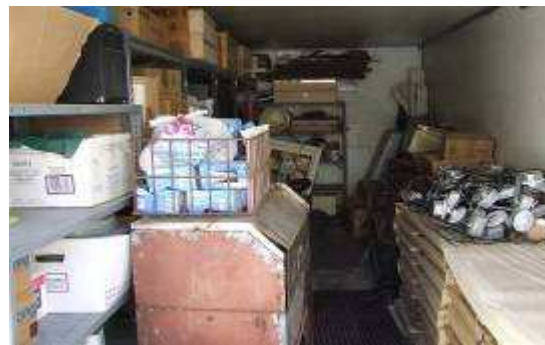
We have plenty of old equipment out in storage.