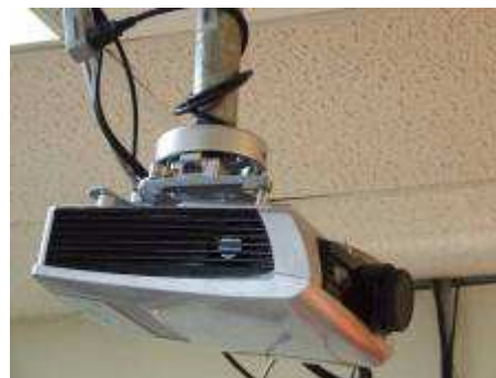
We have a new overhead projector. Kris Koch is helping with club clean up.