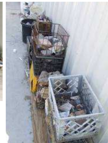
There's rocks out here just waiting to be used.