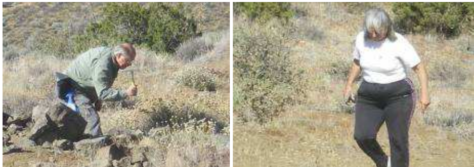
The Witte's are looking for and gathering specimens for future projects.