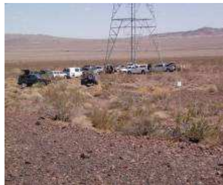
Lavic Siding, the Cady Mountains.

Photographs from the field Trip to the Lavic Siding.