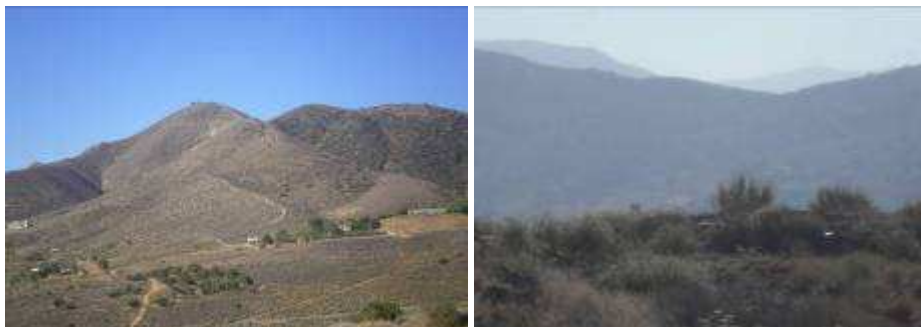
This is the countryside where the Acton Field Trip took place. There are rolling hills in the background and more of a desert scrub where the field trip actually took place.

Thanks to Debbie Savacool who took these photographs.