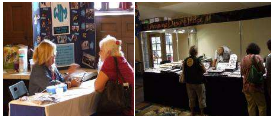
Women in Mining had a stall there and vendors came from all over.