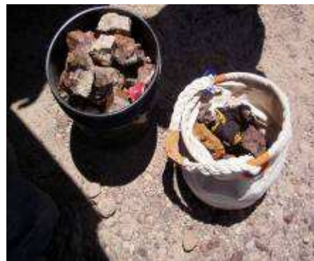
Cory Beck's buckets have all different types of rocks in them for later projects.