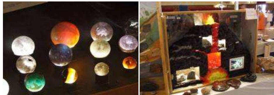
There were displays from various clubs all showing different sides of lapidary.