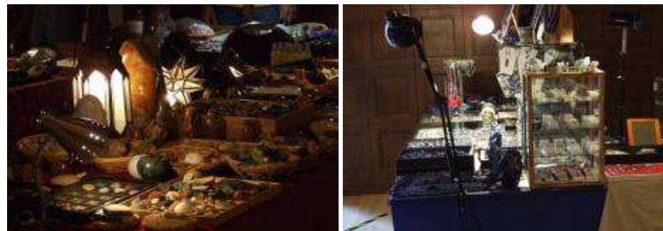
There were quite a few vendors displaying their wares at the CFMS show.