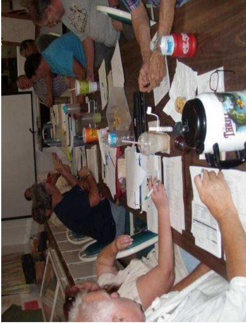
A recent photograph of the club's board