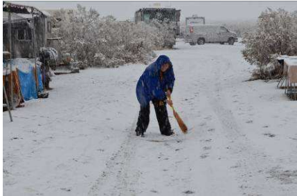
Let's see if I can just sweep this all away.