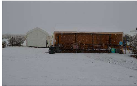
The kitchen and dining room tents on Friday, March 8th as the snow was falling.