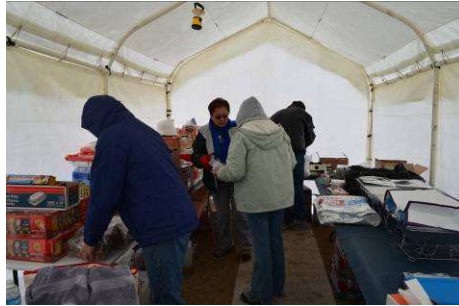
Our members worked hard in the kitchen cooking breakfast and lunch.