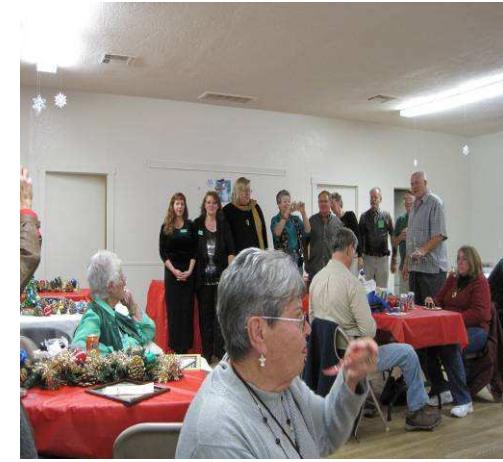
WE SAY GOODBYE TO 2012 AND SAY HELLO 2013 — AND MAY IT BE A WOUNDERFUL YEAR.