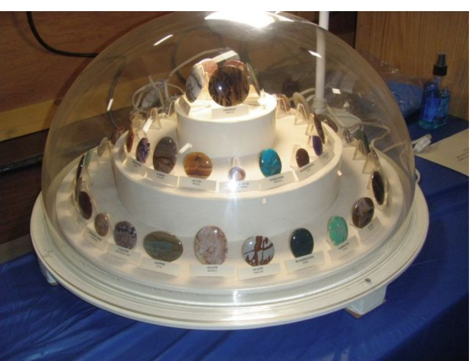
Don Pomerenke entered this display of cabochons in the Barstow Gem Show on December 7th and 8<sup>th</sup>.