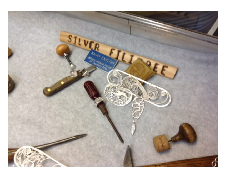
Silver Filigree Class