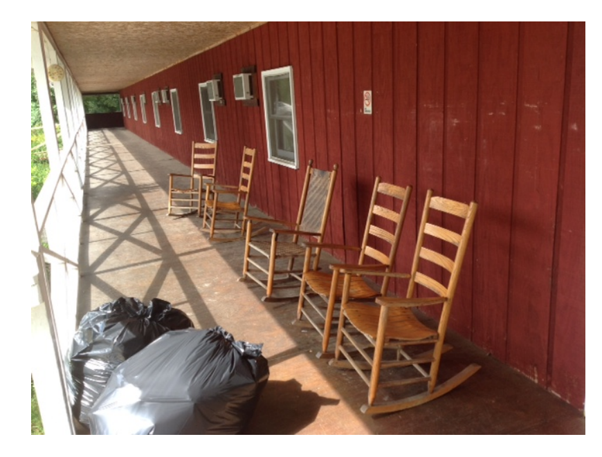
Relaxing in rockers on the porch outside the dorm rooms