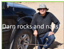
Darn rocks and nails