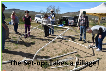
The Set-up Takes a Village!