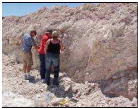
The mine was quite a big operation and members collected specimens.