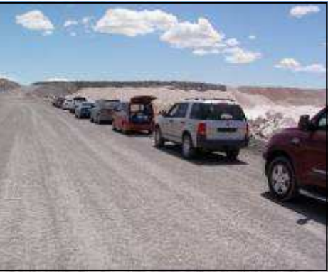
The mine had a well graded but steep road. Members caravanned their way up to the top.