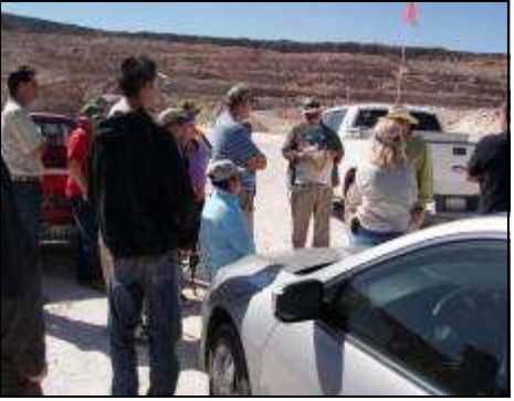
Members are listening to their guide on what to see, expect and what to find.