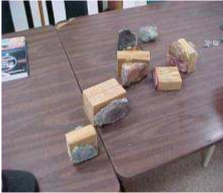
These slabs have been attached to blocks of wood so they can be sawed.