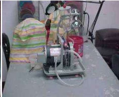
This is the new Intarsia machine that can be used by all of the members.