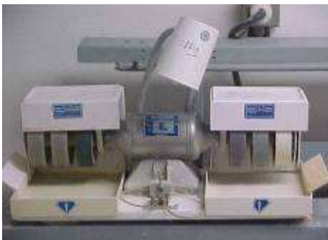
A Genie is cleaned and ready for the next member to work on a project.