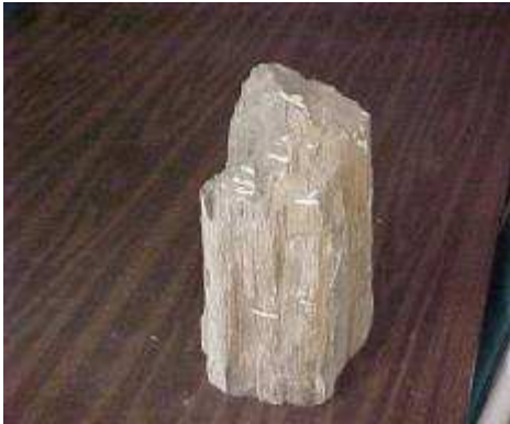
A prospective member brought in this into the club to be identified.