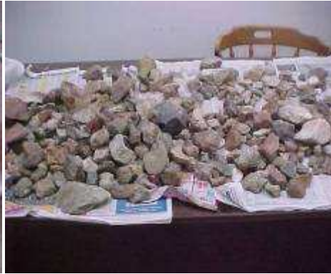
A table full of "leverites" to be put on the hill behind the club.