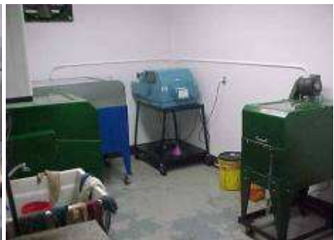
The saw room showing some of the saws members can use.