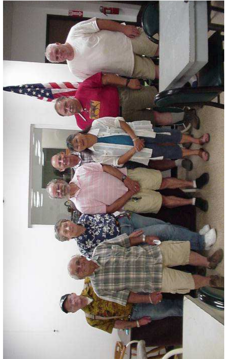
These are most of the club instructors.