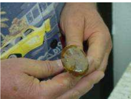
Blaine Witte holds a dopped cab ready to be worked on.