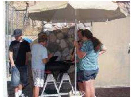
Parents look on under the umbrella.