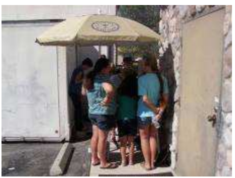
The Pups are working outside.