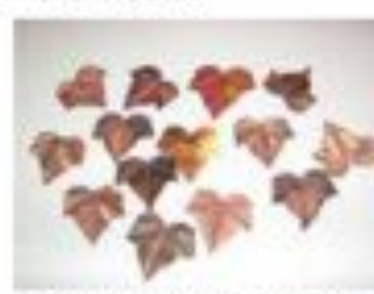
Beautiful leaves finished