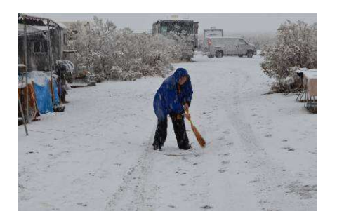
Let's see if I can just sweep this all away.